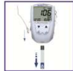
Memory up to 300 sets