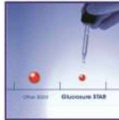
Small volume required

IDH MARKET, OPP AXIS BANK, AMRITSAR. T : (0) 0183-2556654, 5003132 M : +919872986654 E : globaldiag@gmail.com