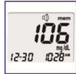
Memory up to 300 sets